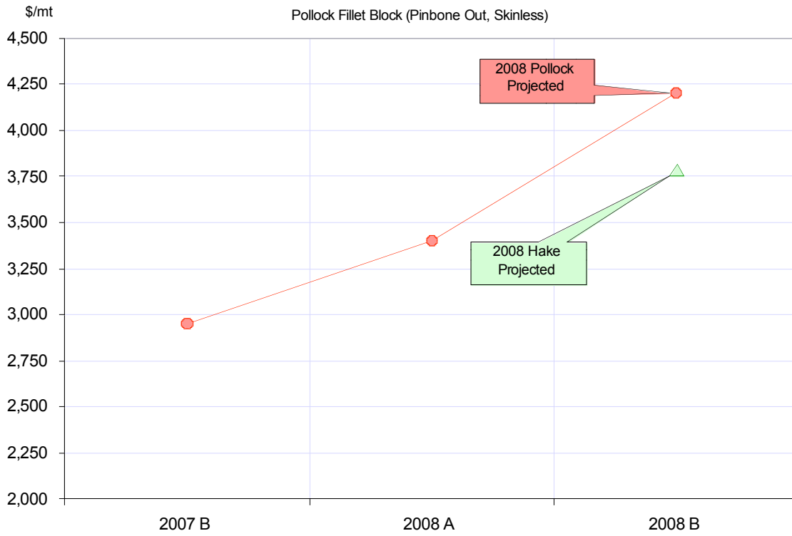
Exhibit 4. Recent and projected prices for Alaska pollock fillet blocks (CIF-Europe, pinbone out, skinless) and 2008 projected hake price.